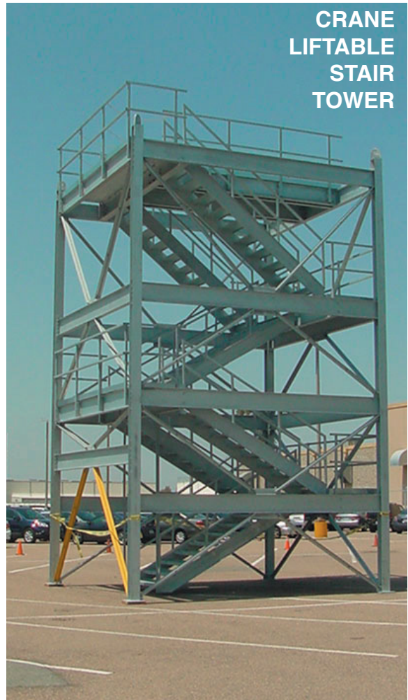
CRANE LIFTABLE STAIR TOWER

The Abtech Tower Systems are, Modular Steel Structures that can be custom designed and engineered for a variety of uses. Common designs include: Stair Towers; Control Towers; Equipment Towers; Equipment Platforms; etc. These structures can be designed to be crane liftable or fixed to a foundation. Our Modular design easily allows for easy assembly at jobsite. Some structures can be pre-assembled at factory and shipped complete. Systems can be Structurally engineered to meet different seismic zones and existing conditions. All steel components can be Painted or Hot Dip Galvanized. Optional Modular Walls, Wire Mesh Fence, Gates, Handrail, Stairs, Ladders, Lighting and Electrical packages are also available. Installation by end user or Factory Trained Installers.